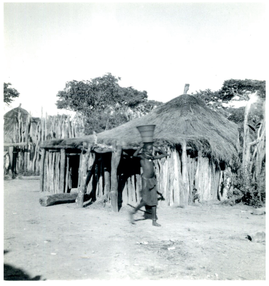
Girl carrying basket outside Tchiliwandele's hut